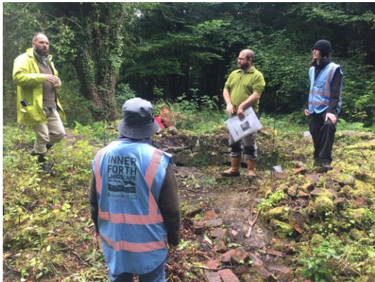
Excavating Valleyfield Estate Stables, Sept 2017