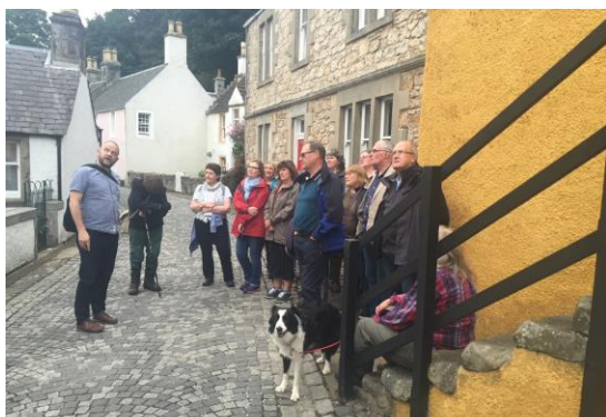
Culross Heritage Walk, Sept 2016 (repeated various times)