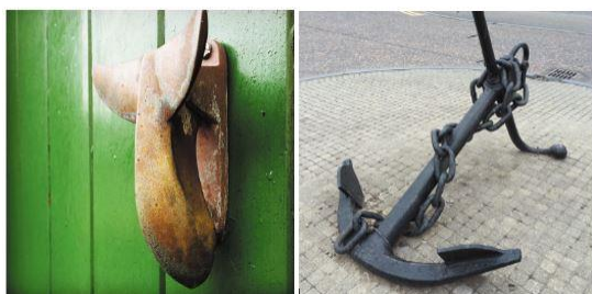
Reminders of the Inner Forth's maritime past